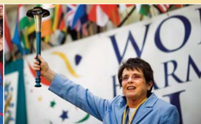
Tennis legend, Billie Jean King, participates in the global launch in New York