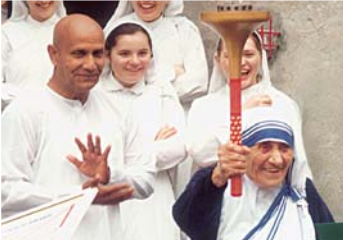
Mother Teresa and Sri Chinmoy celebrate the spirit of harmony.