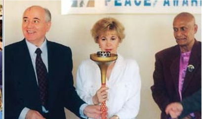
Former Soviet President, Mikhail Gorbachev , holds the torch with Raisa Maximovna, as Sri Chinmoy looks on.