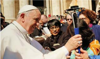
Pope Francis blesses the torch in Rome.