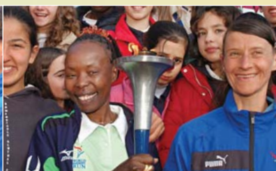
Former world record holder for the Marathon, Tegla Loroupe, with children in Italy.