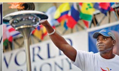
Olympic legend, Sudhahota Carl Lewis, lights the torch at the global launch in New York City.