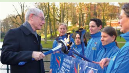
Then European Council President, Herman Van Rompuy, lights the European torches.

The Torch-Bearer Award program recognizes individual efforts by honoring peace-building pioneers from all age groups.