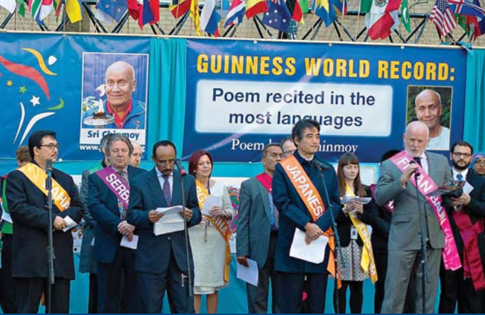
United Nations Diplomats join together to break a Guinness World Record reciting a poem of Sri Chinmoy's in the most languages at the global launch of the Peace Run in New York.