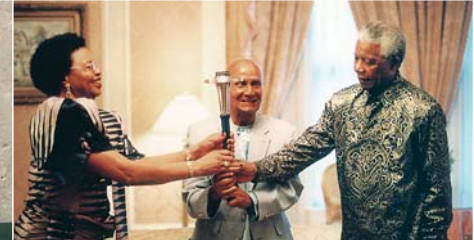
Nelson Mandela , former President of South Africa, and his wife, Mama Graça Machel, with Sri Chinmoy.